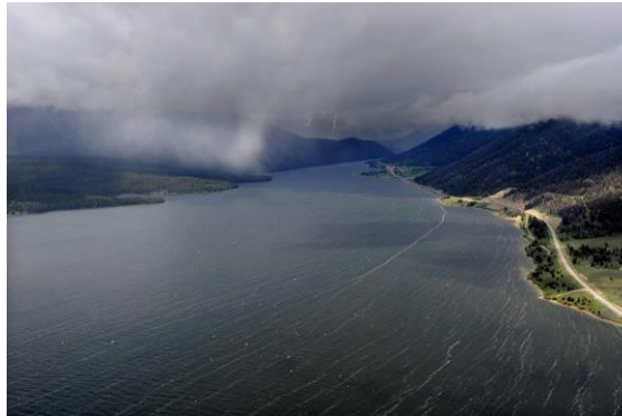
Hebgen Lake