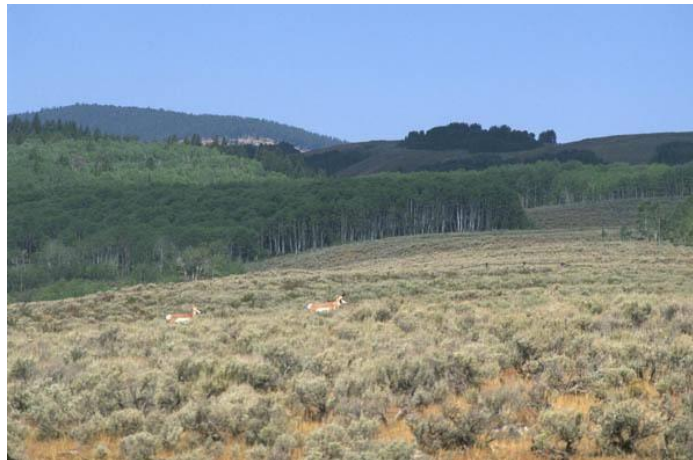
Upper Green River, photo by George Wuerthner