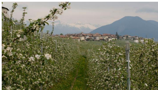
Apple Trees, Italian Farm

https://wilderness-society.org/first-bear-in-germany-in-16.../