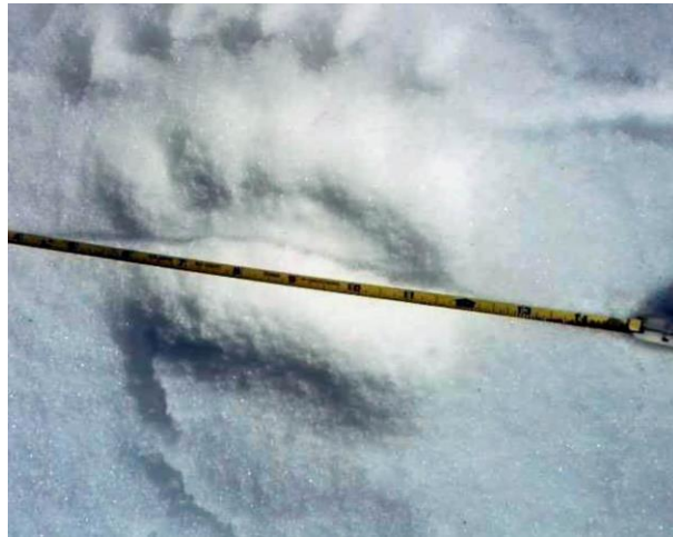
Grizzly Tracks, Grangeville, ID

https://missoulacurrent.com/outdoors/2020/04/yellowstone-grazing-feds-sued-for-plan-to-allow-killing-of-72-grizzly-bears/